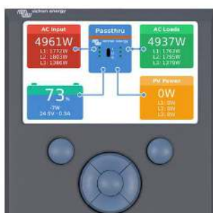
Color Control GX, showing a PV application